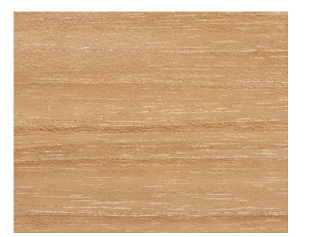
The indigenous color of teak golden brown.