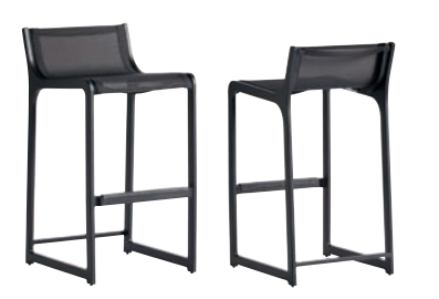
3940-16 South Beach Bar Stool 19W x 23.25D x 38H in. Seat: 30.5H in. Inside: 19W x 16D in. Shown on Cover and page 19