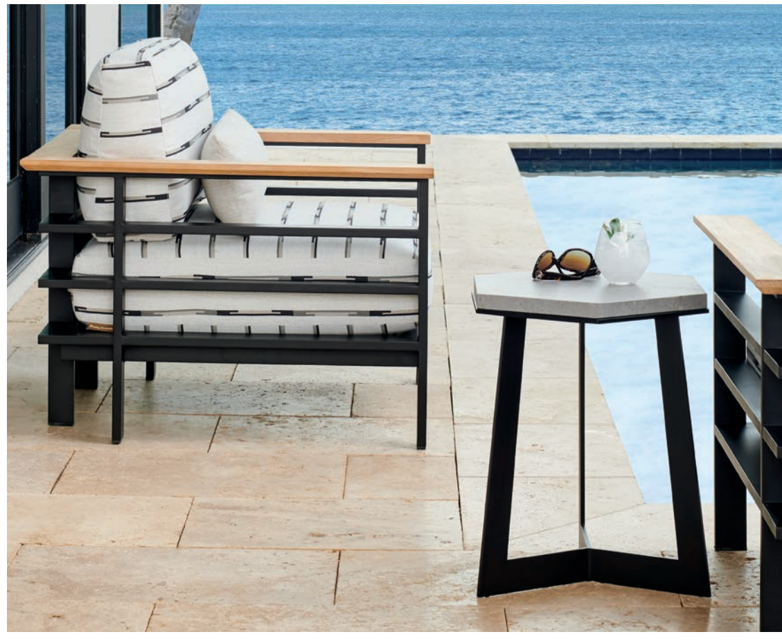
3940-11 South Beach Lounge Chair Frame Only 34.75W x 36.5D x 32.5H in.

3940-950 South Beach Spot Table 18.5W x 16.5D x 21.25H in.