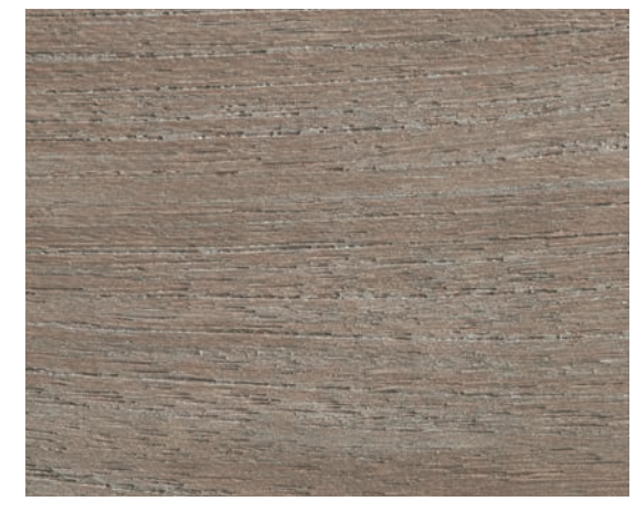
The patina turns to an elegant silver tone, with age.