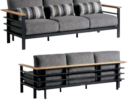
3940-33 South Beach Sofa Frame Only 88.75W x 36.5D x 32.5H in. Arm: 25.25H in. Seat: 17.5H in. Inside: 80.75W x 19D in.

Shown in 7092-71 Gr. C, two 22 x 10.5" Kidney Pillows in 7102-71 Gr. G Shown on pages 4, 5, 6, 7 and Back Cover