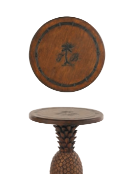
3100-200 Alfresco Living Pineapple Table Base & Top 18.25 dia. x 22H in. Light Sienna Top on Golden Sienna Pedestal